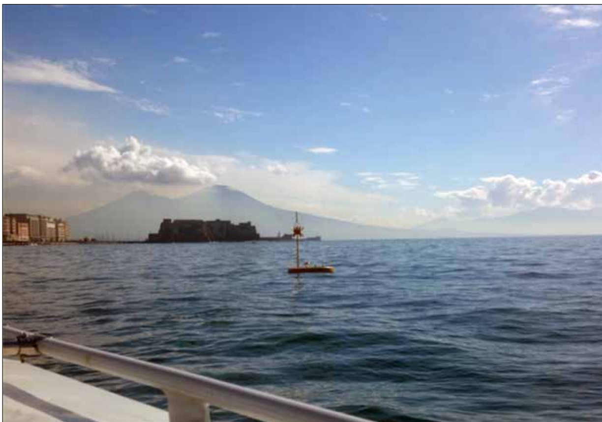
Fig. 2 A CytoBuoy in the Gulf of Naples (the instrument is mounted under water)

watertight floating instrument, appropriately called CytoBuoy – see figure 2 – that is equipped with solar panels for extended remote operation, and a submersible called CytoSub that is encased in a pressure-resistant housing enabling it to be lowered to a depth of 200 meters. Dubelaar explains, “In every case, our in situ products are based on the same measurement engine found in our benchtop laboratory products. In addition to a water-tight enclosure, these instruments all feature miniaturization of the optics, fluidics and electronics, minimized power budgets, and stable long-lived components and robust instrument construction.”