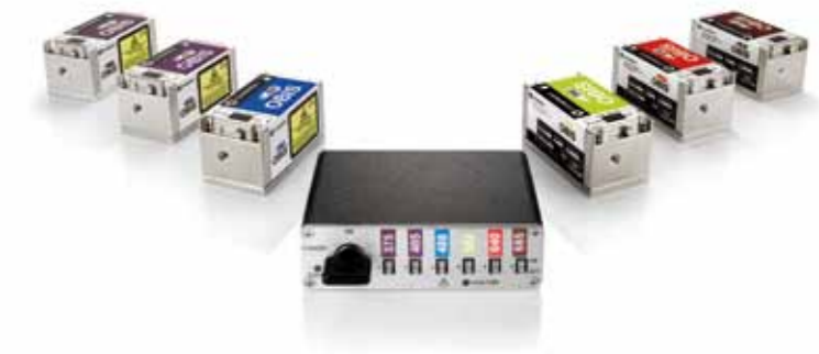
FIGURE 3. OBIS SMART LASER MODULES PROVIDE PLUG & PLAY FUNCTIONALITY AND IDENTICAL FORM AND FIT ACROSS A WIDE SPECTRUM OF WAVELENGTHS